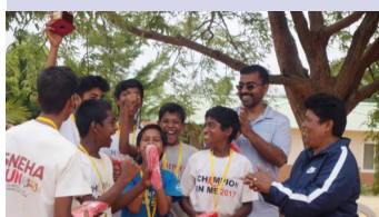
Winners of the Tournament

“I honestly felt that it was a professional coaching.”