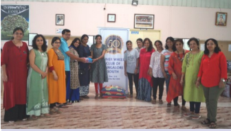
Inner Wheel Team