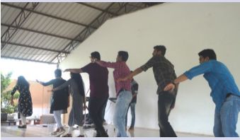
“Jesus Calls” Group

This was the time when the pain started showing off, I had no options but to complete my run. In the 8 th Kilometer I almost wanted to stop as the pain on my thighs was very severe but I couldn't give up, instead slowed down. I completed the run in 42 minutes which is 4 minutes slower than my usual time. My coach was happy as he didn't have too much of expectation on me for this run, but I was indeed disappointed and not happy. After the race we got to meet a few important persons. Later that day we visited the capture point of Nelson Mandela and the railway station and some other important places. Being grateful to God for all that happen, I returned home.