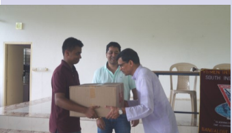
Sharing is giving

On September 2 nd the Y's Men International, South Zone Group visited Snehagram and spent some time interacting with the students. They proved their solidarity and love through sharing some cookies, nutrition biscuits and eatables with children. We happily participated in the events and performed some programs to inspire and motivate youth who came along.