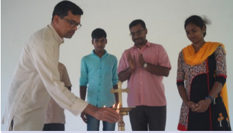
Let there be light...